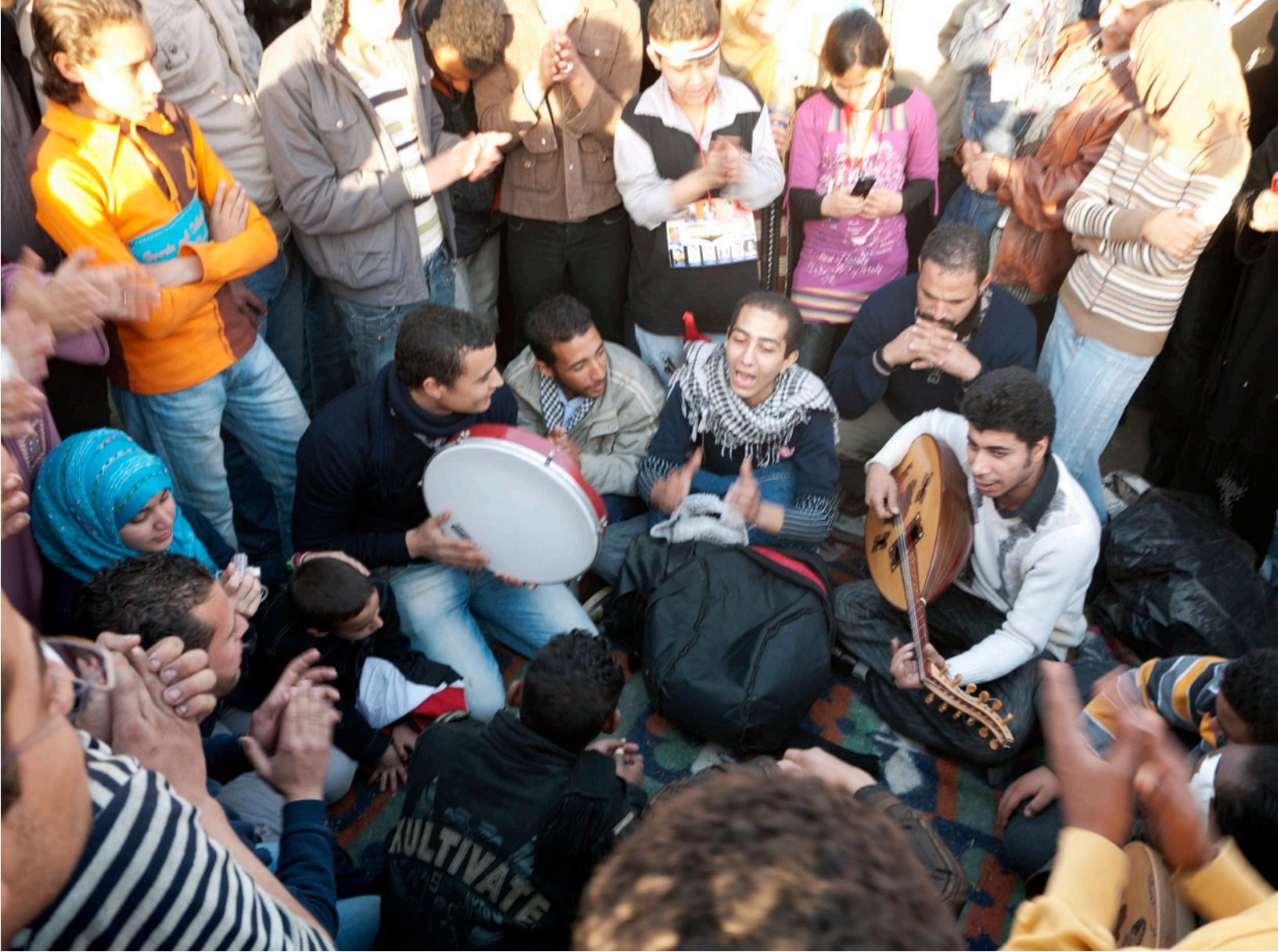
Young activists sit in solidarity at a protest against the National Security forces in Tahrir Square in early March, 2011.

Finally, Egyptian politics is by no means free of foreign involvement. The country's critical role in regional geopolitics