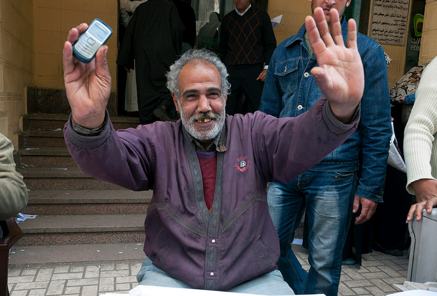
A man in Damanhur welcomes researchers.

Mobile phones may have played the role of the most tangible technology in the revolution. At a basic level, text messages and voice calls enabled the Egyptian people to coordinate, to stay informed, and to communicate amongst themselves and to the outside world. That is, until the government began interfering with internet and mobile networks beginning on January 25. What began as the blocking of Twitter and Facebook became the complete shutdown of both services. Fully functional mobile services were not restored until February 3.