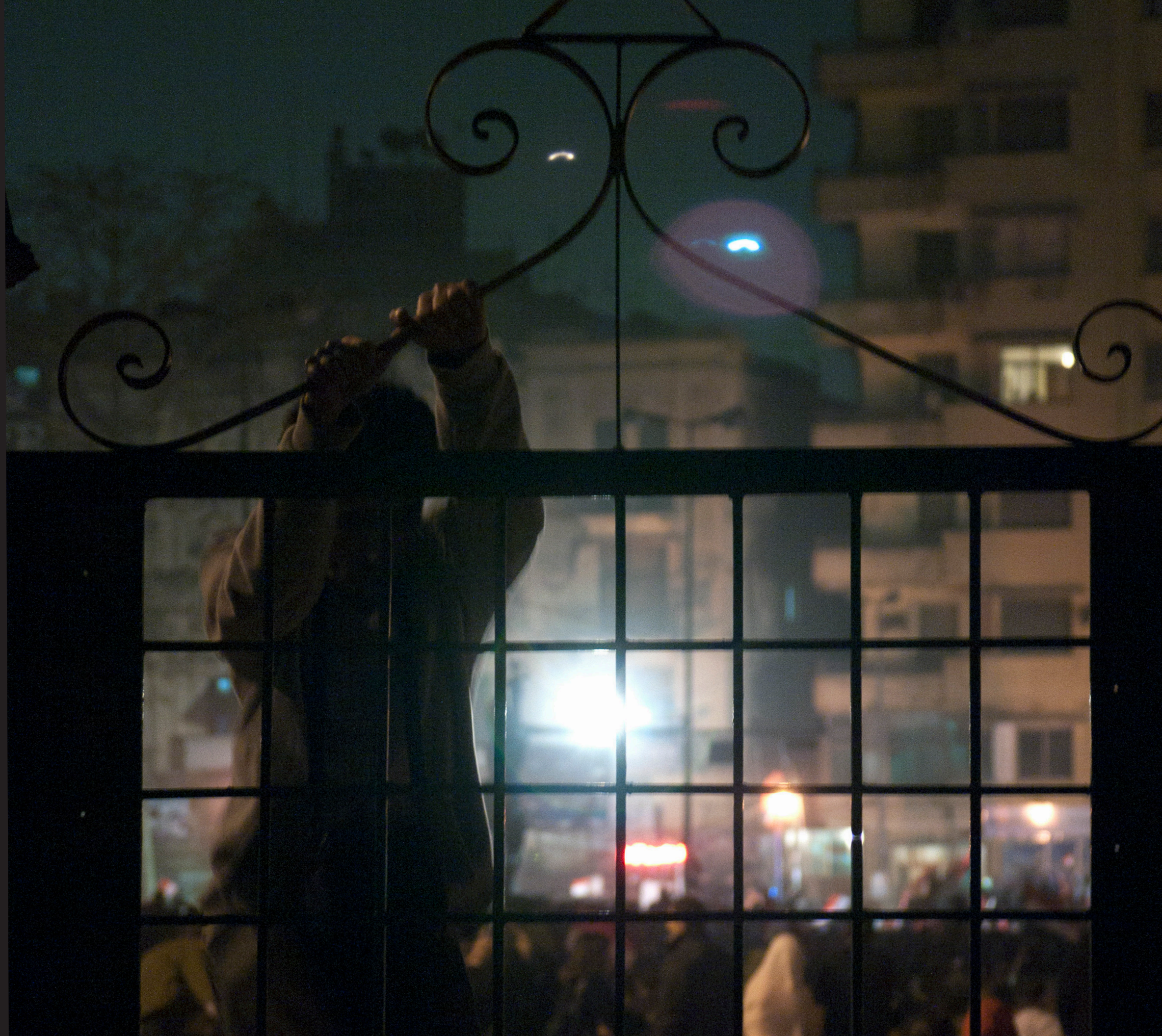
Research team scales a fence in downtown Cairo to get footage of the protests.

Accessing female participants also proved challenging, but this was expected given the Arab context. In sum, one-quarter of our respondents were female. In our photos, men also strongly dominate — this is due to widespread objections to the photographing of Muslim women from both sexes and from older generations. We did, however, speak with many strong women who played critical roles in the revolution and will continue to do so in the months and years ahead. ■