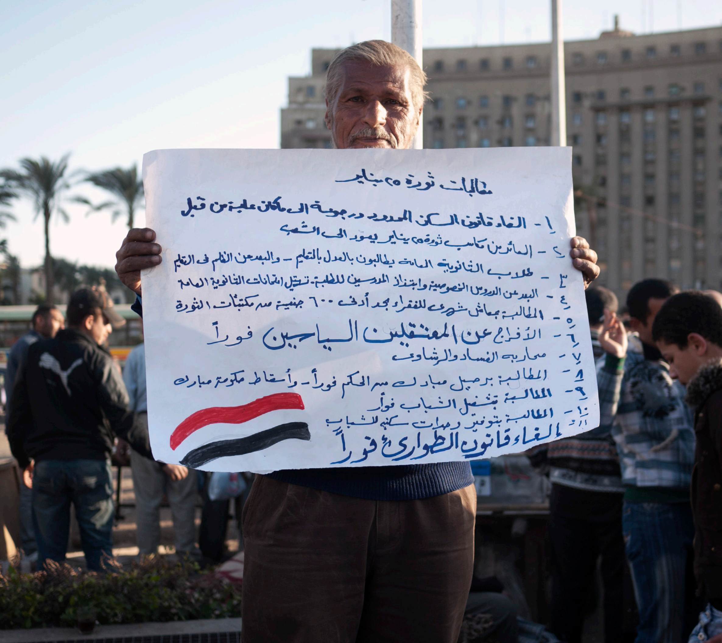
A man in Tahrir Square lists his demands for political reform.

Established institutions such as Egypt's legal community are at the heart of the political transformation now underway. Mini-revolutions will continue to ripple through these organizations as internal reformers push out leader's that were tainted by the corruption of the previous regime. These internal change agents need political, economic and organizational support to cement their gains and strengthen the democratic capacity of their important institutions. Groups seeking to encourage progressive reform in Egypt would do well to identify and enable the efforts of such actors. Their success will in many ways determine how far systemic reform advances as a result of the initial revolution. ■