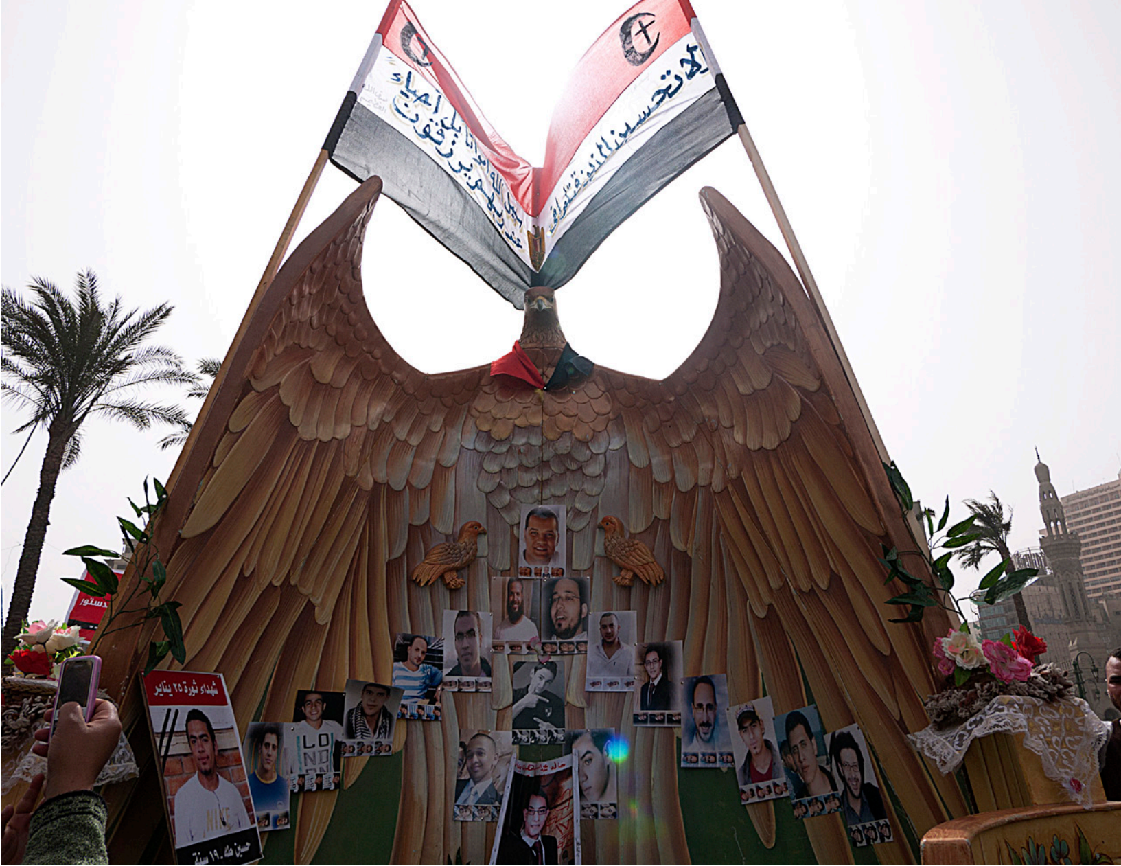
A monument in Tahrir Square honours those who were killed during earlier protests.

For a people who have spent decades disabused of notions to engage in governance, it will take time, money, and resources to establish the knowledge and systems needed to create a participatory framework. Education on the practical mechanisms of political participation will be critical to building long-term democratic capacity. Many Egyptian groups have the infrastructure and credibility necessary to provide such training, the result of years of experience in underground capacities. Post-revolution, as they emerge into the open, we must support and build upon their existing credibility and ongoing efforts.