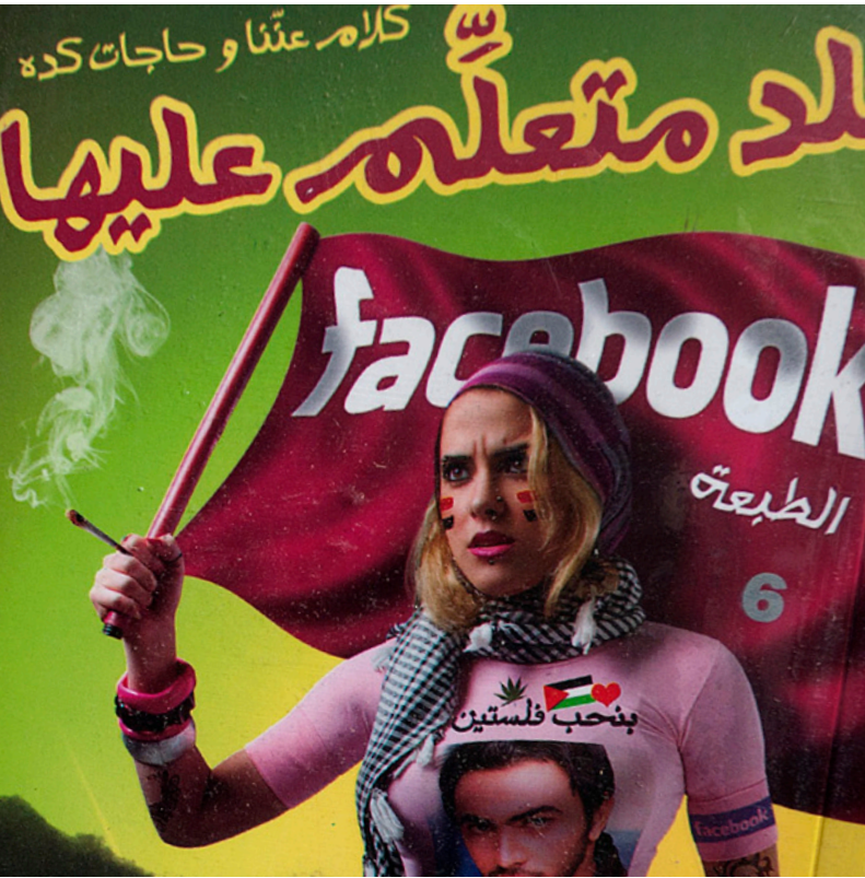
1. An activist behind the April 6 Youth Movement shows us their various Facebook pages. 2. The cover of a pulp novel, seen here at a roadside bookstand in Cairo, portrays Facebook as a corrupt tool for Western influence.