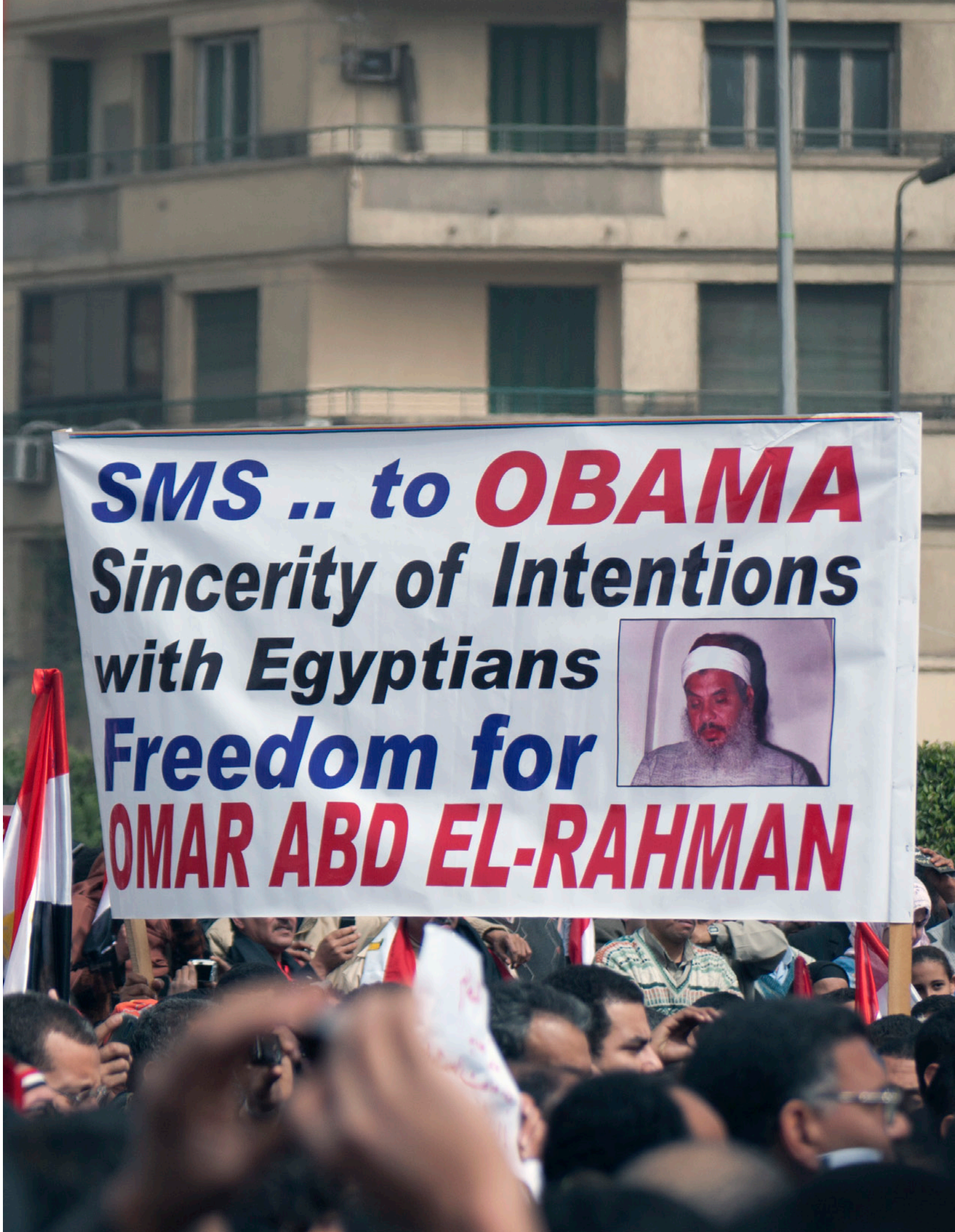
1. From the collection of a bookseller in Cairo: “The Facebook Story: Revolution and Riches.” 2. Protesters in Tahrir Square ‘send an SMS’ to US President Barack Obama.

As an amplifier of human intent, technology will only be as only as effective as the offline social networks it is built upon, and only as good as human intent is able to direct it. Deeper sociological change, from education reform to political restructuring, will be necessary before technology can increase its role in shaping the future of Egyptian society. ■