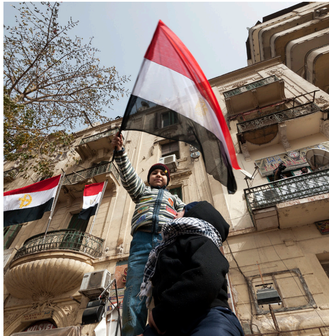
A young girl proudly raises her Egyptian flag on the outskirts of Tahrir Square.

Barring an almost unimaginable change of circumstances, any reform in Egypt will have to gain at least tacit approval from the military leadership. While their interest is in controlling the tempo of change, they are also willing to accept and oversee substantive reform.